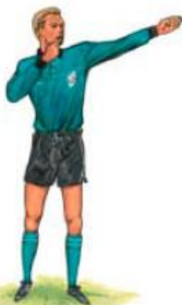
Direct free kick