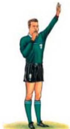
Indirect free kick