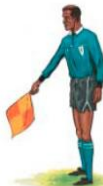
Offside on the near side of the field