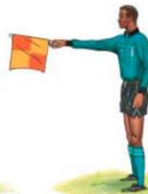
Offside in the centre of the field