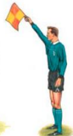
Offside on the far side of the field